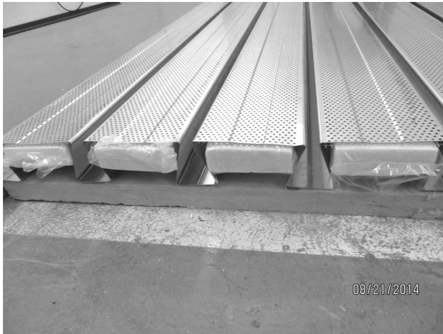
Figure 2 - Detail of the test specimen.