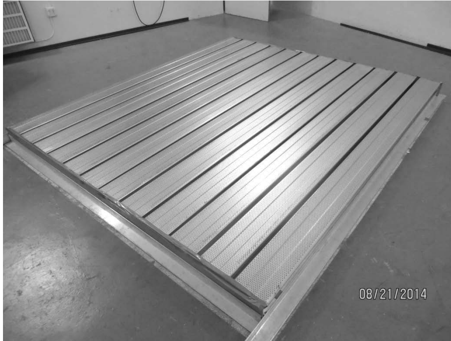
Figure 1 - Specimen mounted in the test chamber.