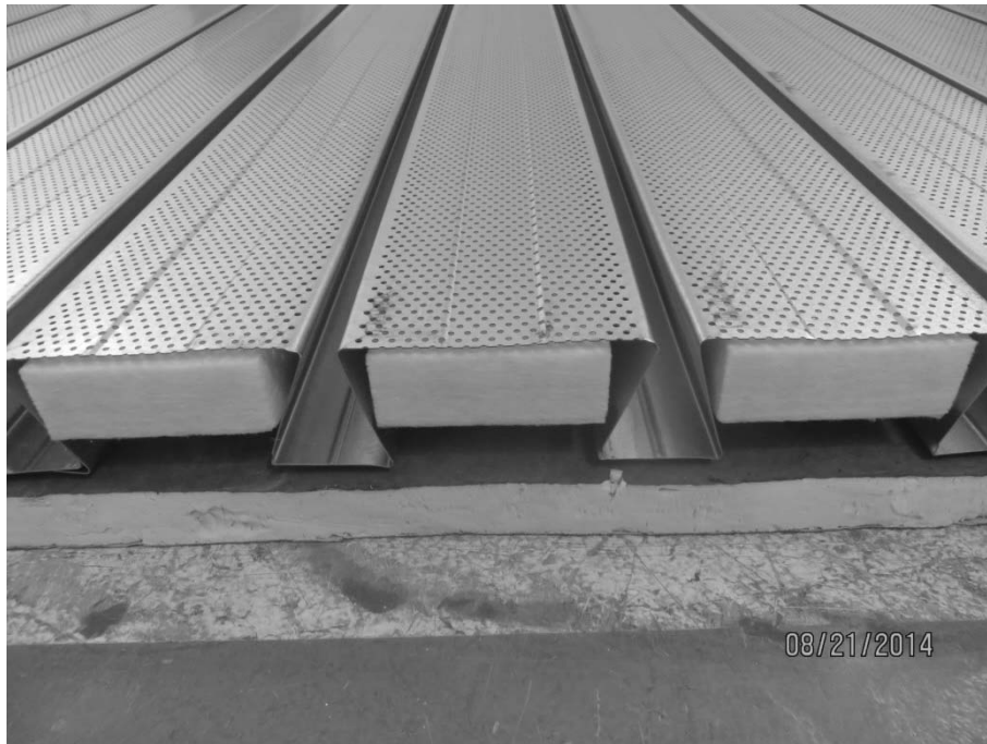
Figure 2 - Detail of the test specimen.