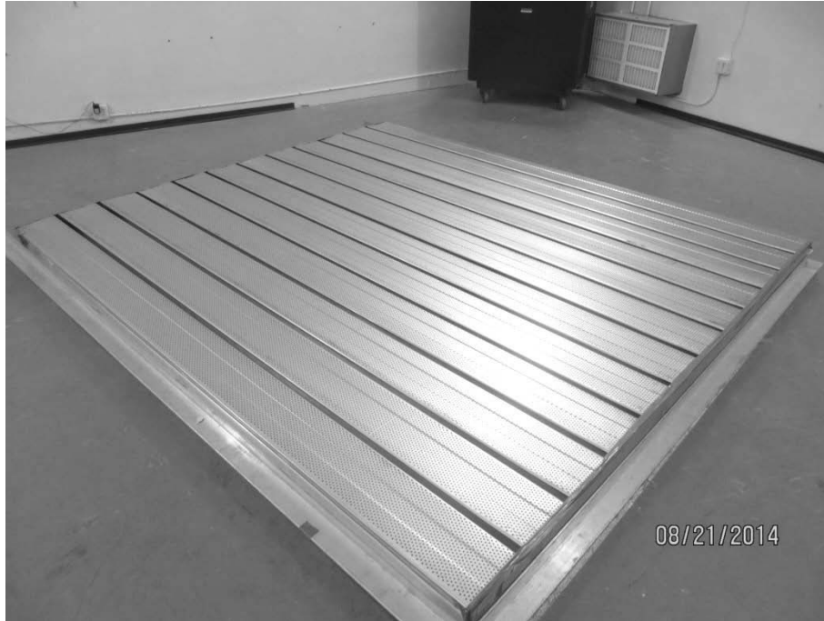
Figure 1 - Specimen mounted in the test chamber.